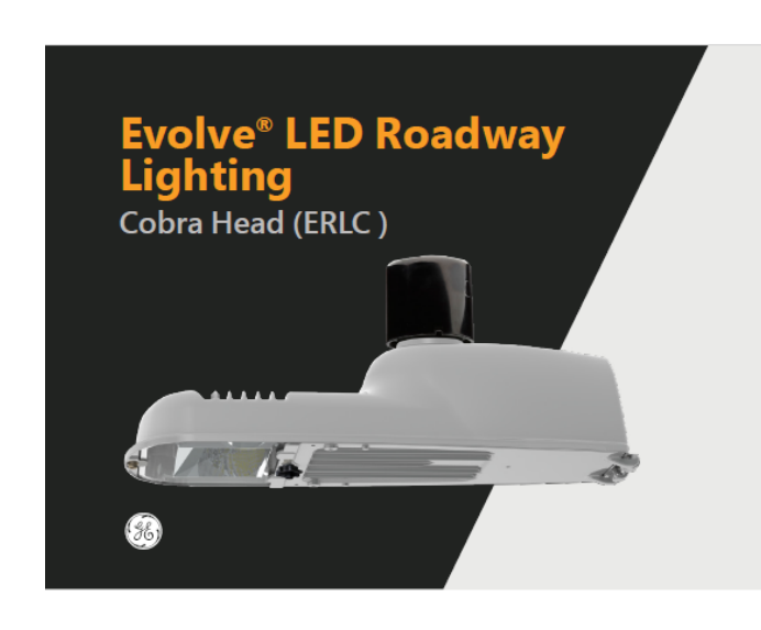
EXHIBIT A – 28 Watt Residential Roadway Luminaire GE ERLC-0-04-B5-40-A-GRAY-L

Project Name City of Santee - Residential __ Туре__ Notes_