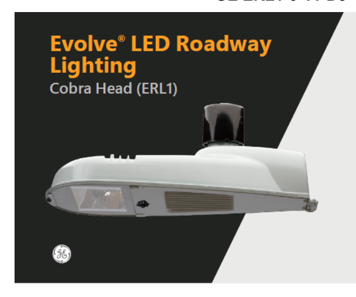
EXHIBIT C – 87 Watt Intersection Roadway Luminaire GE ERL1-0-11-D5-40-7-GRAY-L